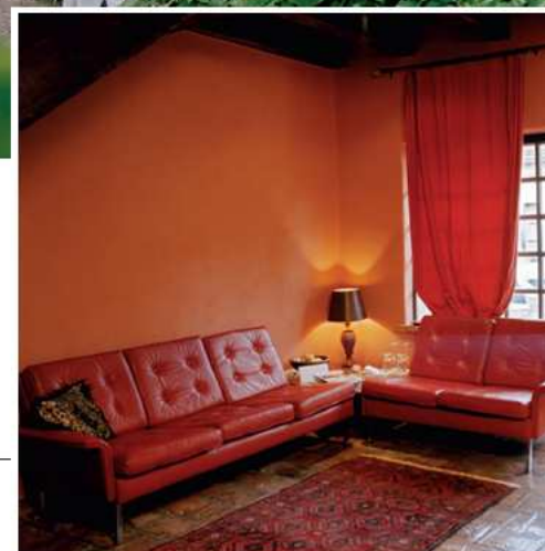
Taubenkobel Clockwise from above: perch topped with fried celery served at the restaurant; the outdoor dining area; a room at the hotel.